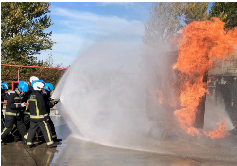
In recent years, the business has introduced a second dual firefighting module and various firefighting props

When the industry suffered a downturn in 2016, Petans introduced a further grant to